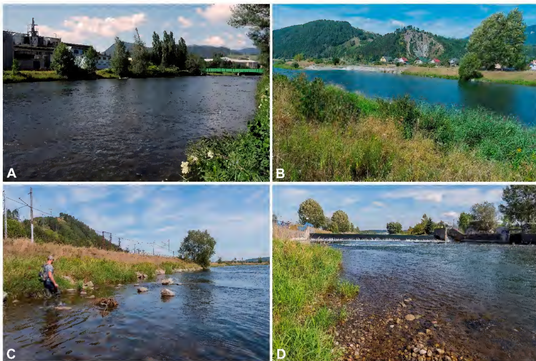
Fig. 2. Locations and habitat of Natrix tessellata near Ružomberok. (A) Location in Ružomberok where the first individuals were observed. (B) (C) (D) View on the habitat near Lisková village.

adult male and one dead adult individual near the dam Liptovská Mara (the largest dam in Slovakia; 49.093°N, 19.486°E; 554 m asl; loc. 5). We had attempted to find this species in Liptovská Mara during July 2017 but were unsuccessful. However, as these locations are close to each other, we expect the Dice Snake to occur throughout this part of the river. The locations described herein represent the currently highest elevations for N. tessellata in Slovakia. We also surveyed apparently suitable and lower locations between Ružomberok and to the west as far as Kral'ovany where any Dice Snakes were recorded.